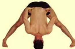
Prasārita Padottānāsana B