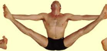
Upaviṣṭha Koṅāsana B