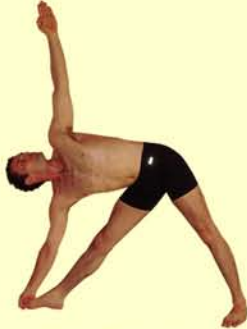
Utthita Trikoṇāsana A