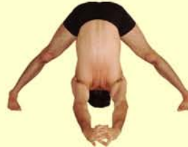
Prasārita Padottānāsana C