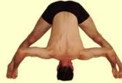
Prasārita Padottānāsana D