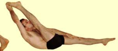
Supta Pādānguṣṭhāsana A