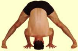
Prasārita Padottānāsana A