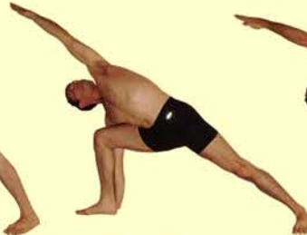
Utthita Pārśvakoṇāsana A