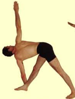
Utthita Trikoṇāsana B