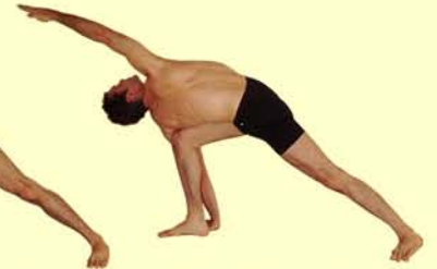
Utthita Pārśvakoṇāsana B